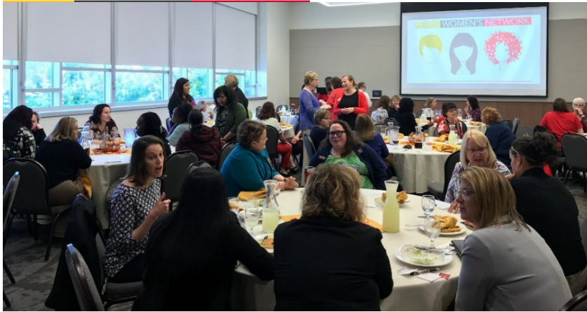
Photo: September 2019 Kickoff Event