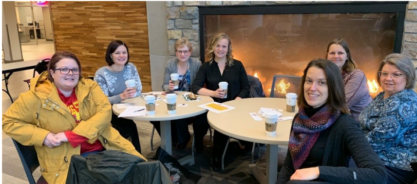
Photo: Wake-Up Wednesday Networking, February 2020