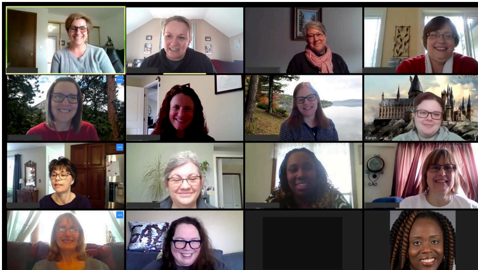
Photo: April 2020 Virtual Networking Event