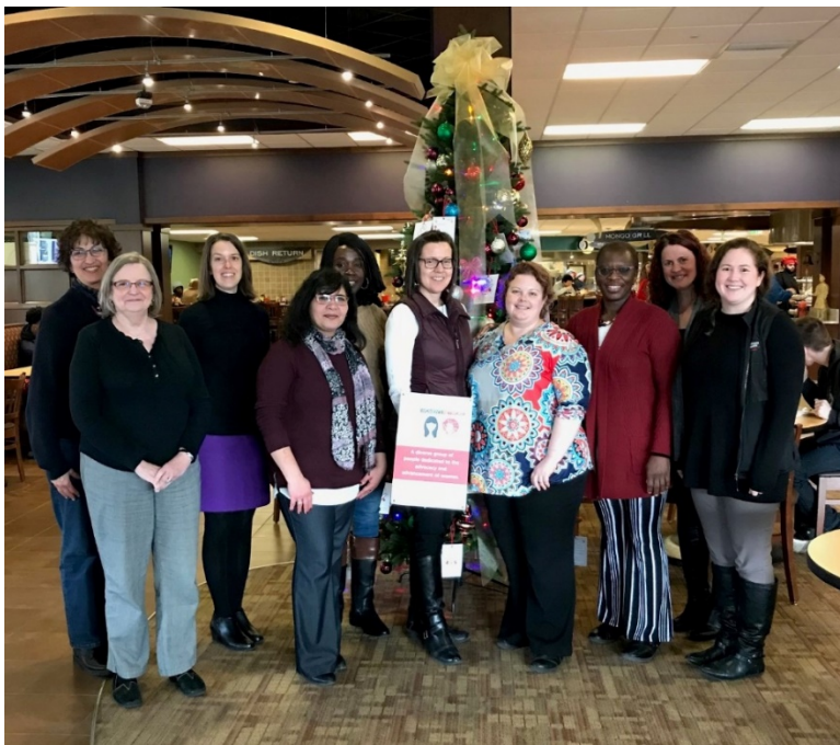
Photo: November 2019 Networking Lunch at The Rock Café