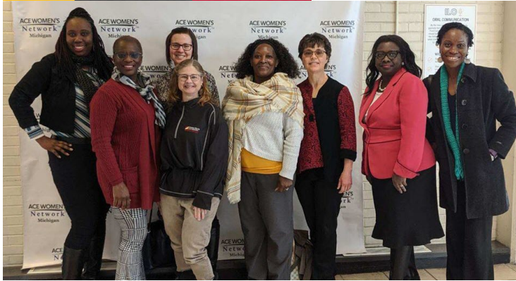
Photo: Women of Color Collaborative Luncheon, Dearborn, MI, November 2019