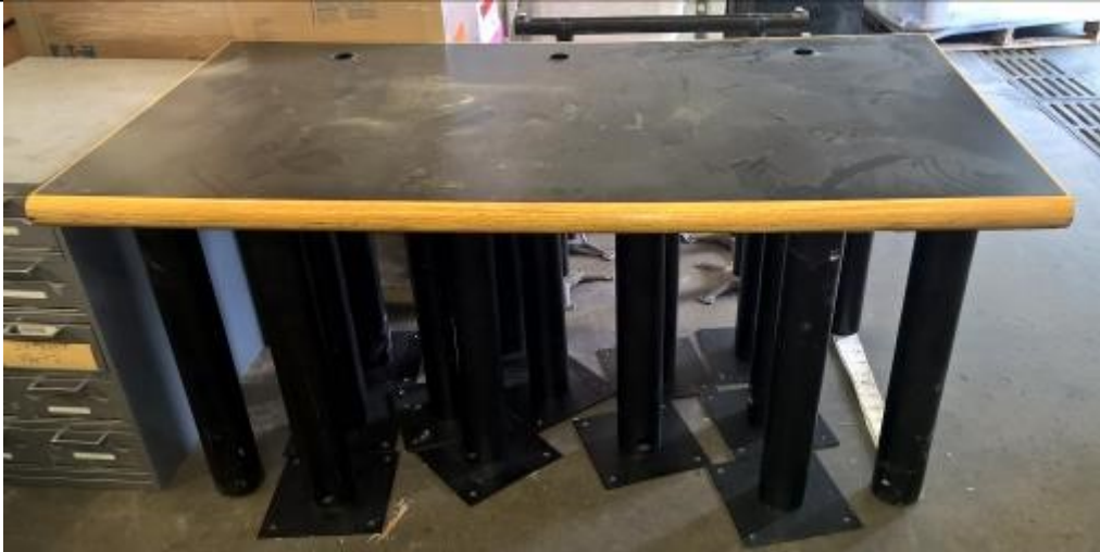
Table have four of these, bidding per each. Tables are 66" wide and 36" deep. Highest bidder select preference and quantity then we work down to next bidder (picture shown includes legs from multiple tables) Highest Bid $15