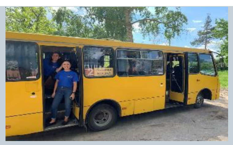
Our ride to clinic everyday!