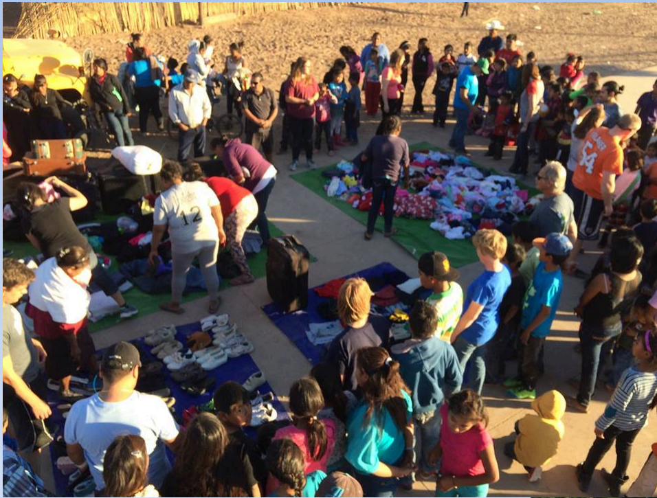
Left: The Children's Ministry team forming a human fence as free clothes and shoes are laid out for families to choose from