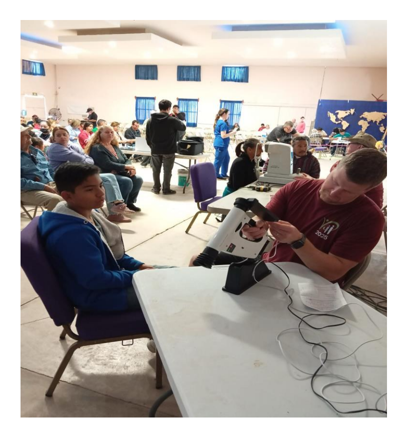
The Eye Clinic Team