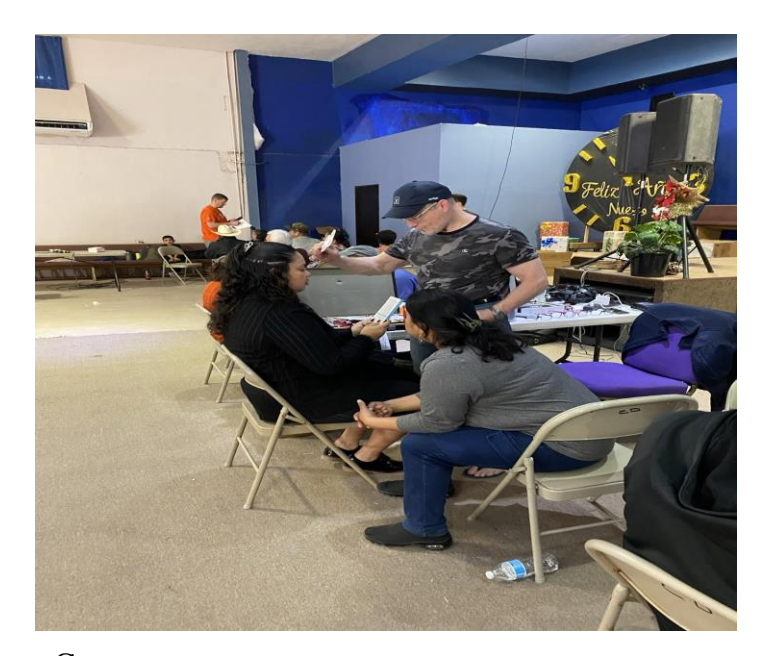
Seven: Doctor Assessment