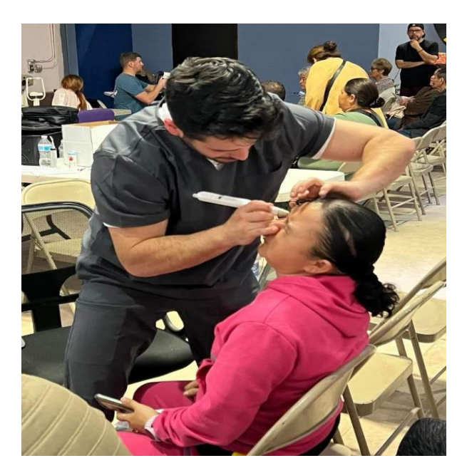
Four: Pressures, EOMs, and Pupil Testing