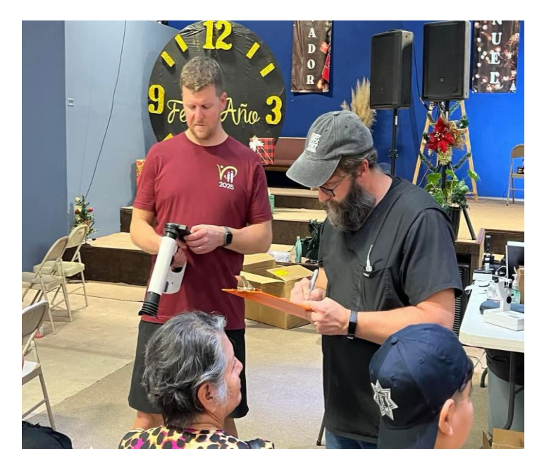
Six: Retinal Camera