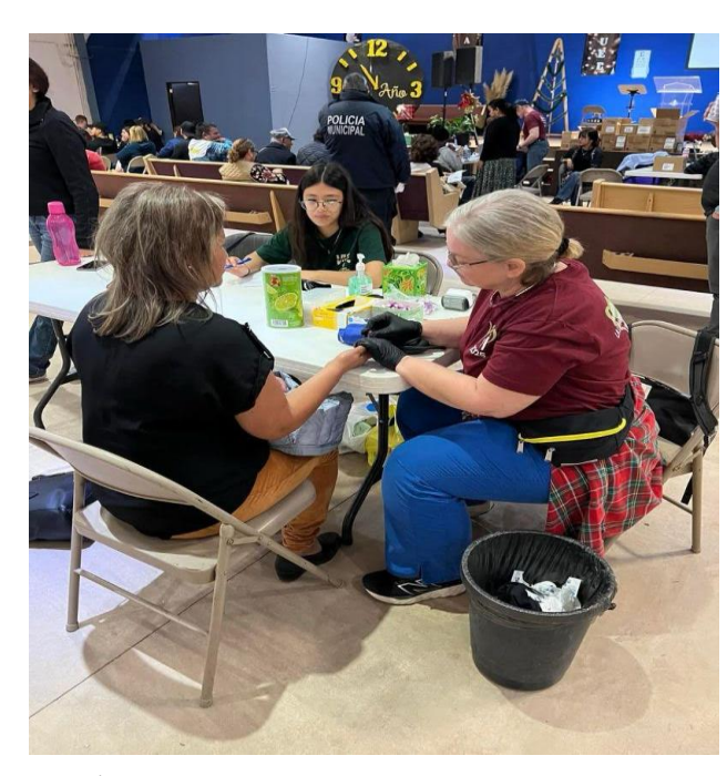
Three: Blood Sugar and Pressure