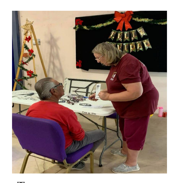
Two: Near and Far Visual Acuities