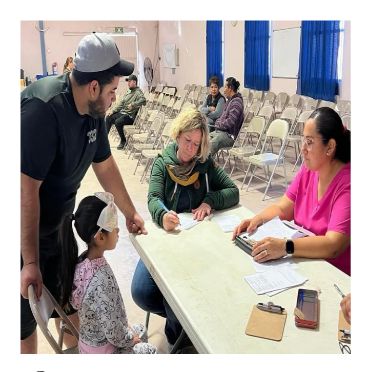
One: Case History