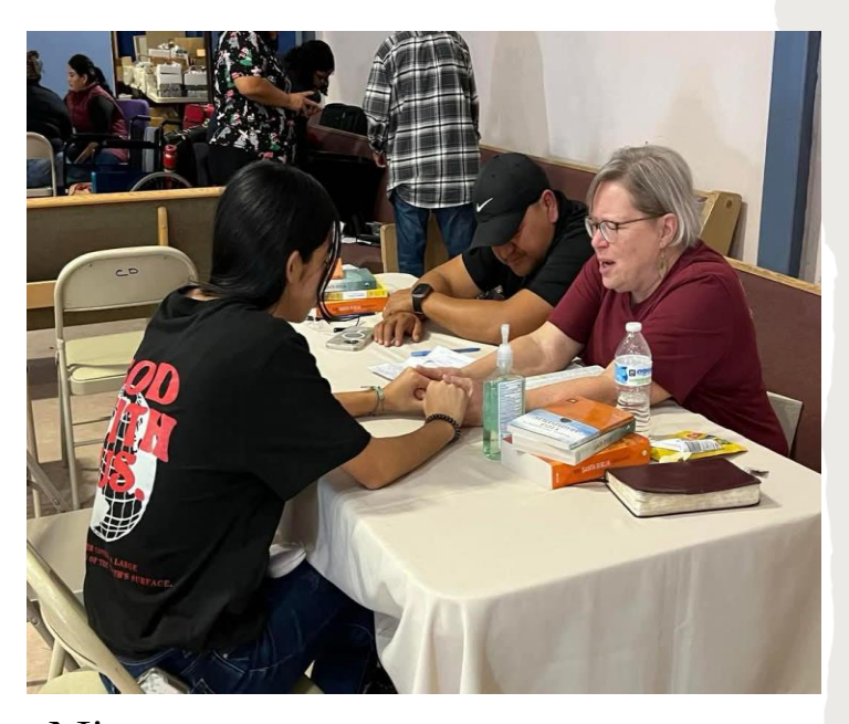
Nine: Prayer & Evangelism