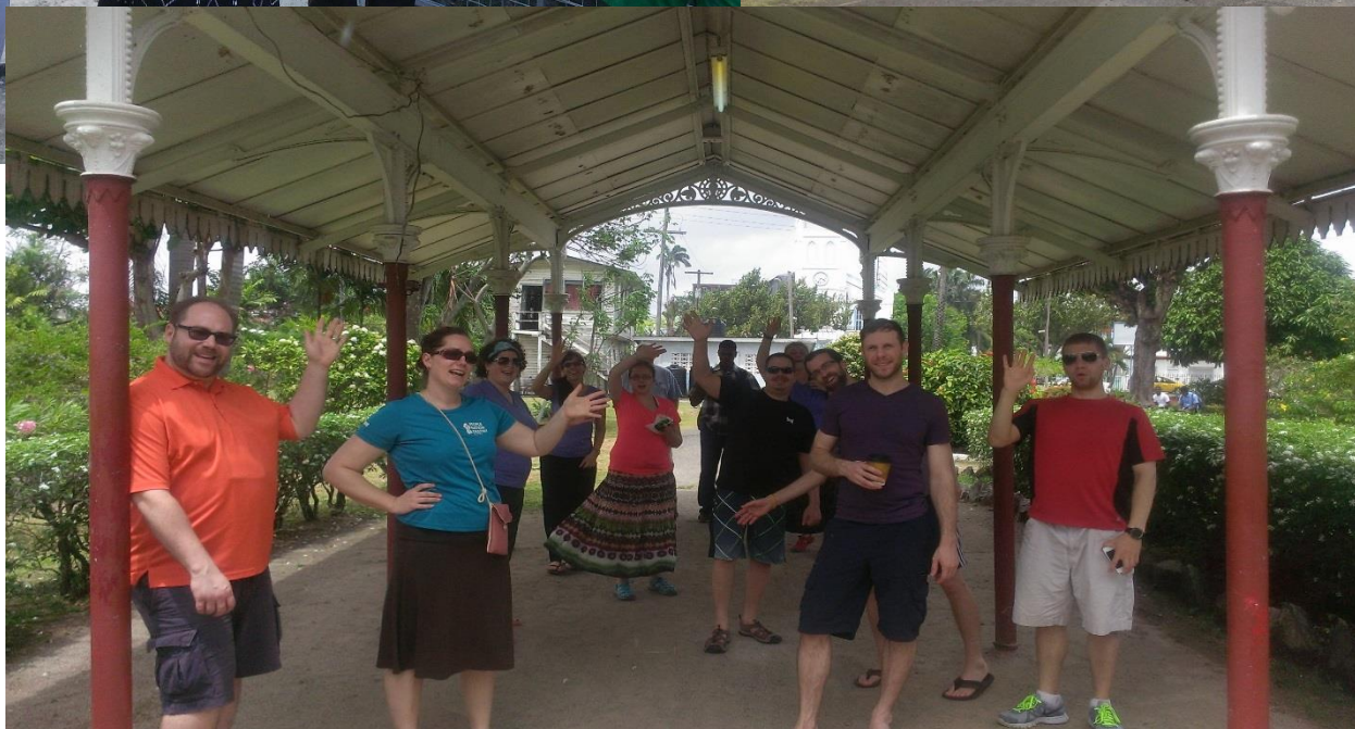
The team had some time to relax, enjoy coconut, and explore Georgetown, the capital city of Guyana