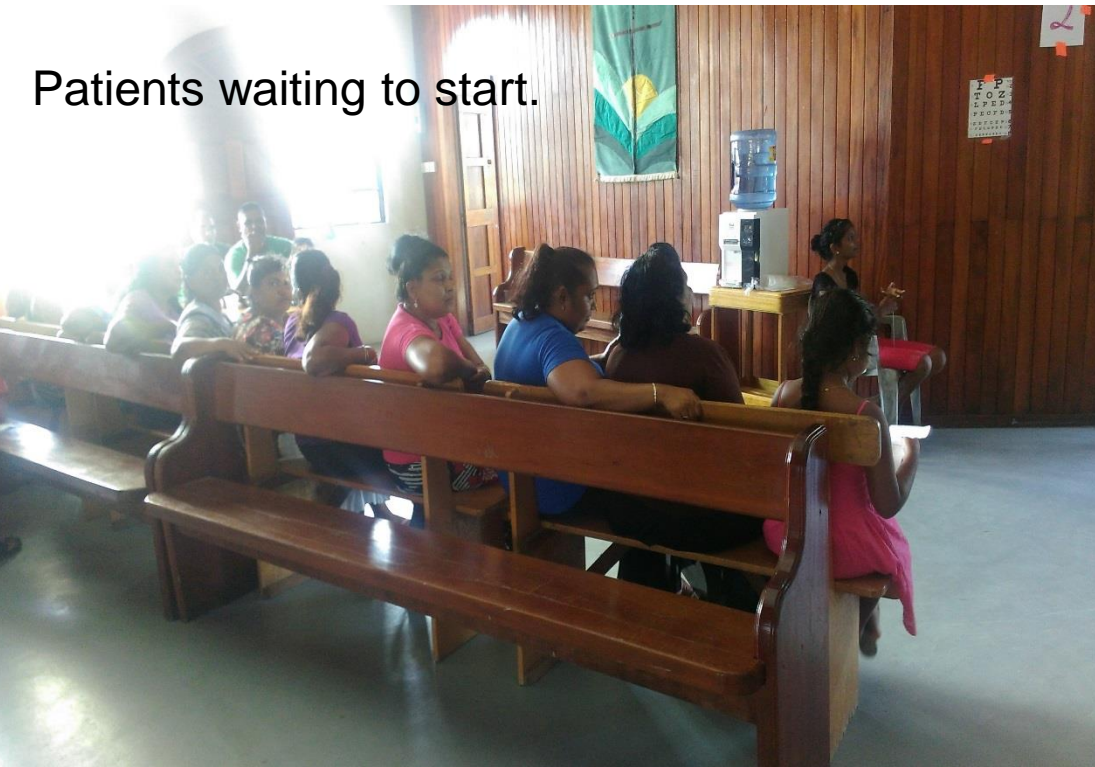
Patients waiting to start.