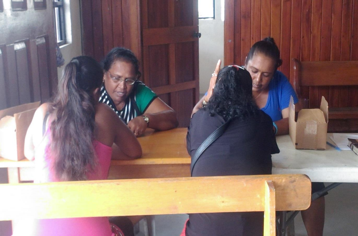
Praying for new believers.