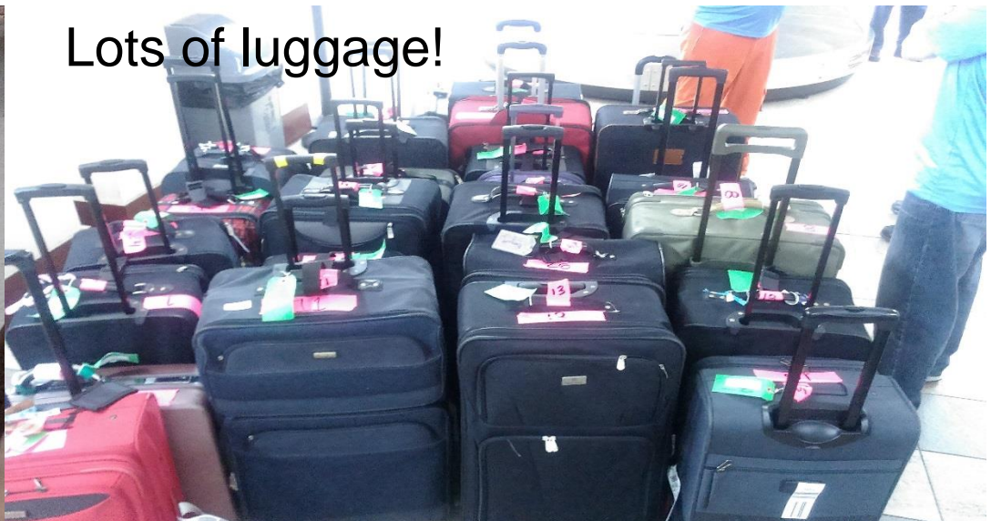
Lots of luggage!