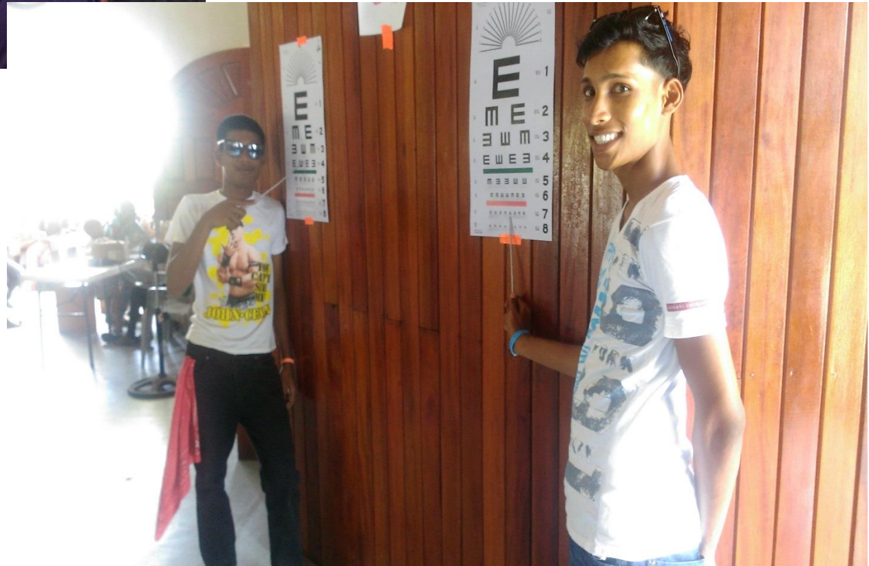
Volunteers help with visual acuity testing.