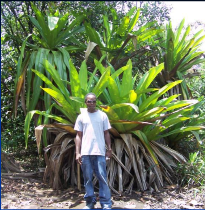
Walking through the jungle