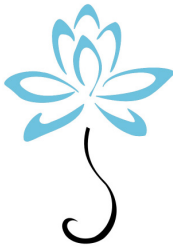
Fall 2018 Issue 6