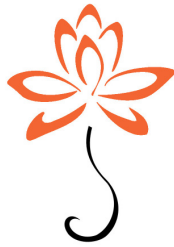
Summer 2019 Issue 5