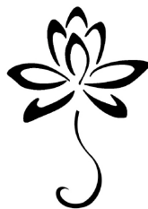
Fall 2018 Issue 1