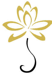
Fall 2018 Issue 4