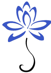
Spring 2019 Issue 1