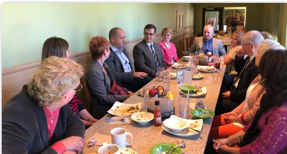
Colleagues from Limerick Institute of Technology in Ireland and Hogeschool Utrecht in the Netherlands joined us on October 4th and 5th to develop and strengthen exchange partnerships and curricular collaborations.