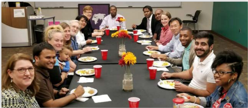
The Office of International Education hosts a monthly international potluck for faculty and staff. The picture above was taken at our September gathering. If you would like to join the next potluck, please connect with us.