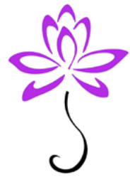
Spring 2019 Issue 2