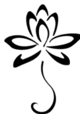
Fall 2018 Issue 1