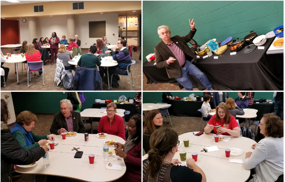
International Education Week was held November 18-22. To conclude the week-long celebration, we invited faculty and staff to a potluck on Friday, November 22 in the IRC. We enjoyed delicious dishes from different cultures and fellowship among colleagues.