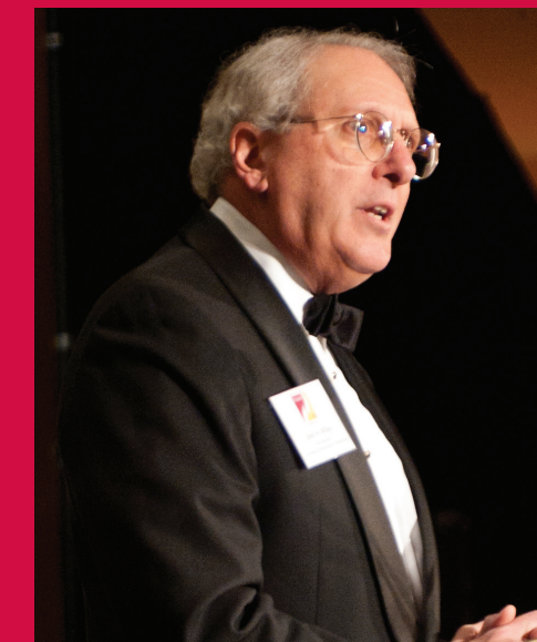
John Willey Foundation CEO and University Vice President