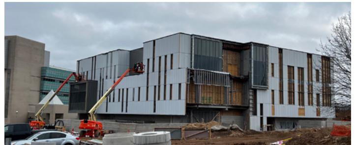
CONSTRUCTION IN PROGRESS, TAKEN 12.13.22

The new Center for Virtual Learning building is amazing, and our pending move this summer is eagerly anticipated! The space is truly incredible in terms of learning spaces, views, proximity between labs and offices... really in every way! I was fortunate to get a tour recently and shared a few photos of the new learning spaces on Facebook . Know that we are already working on events that will welcome you all back to campus to tour this beautiful and functional new space, once open to the public!