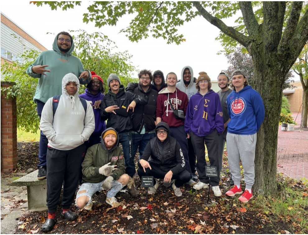
Sigma Pi volunteers for Fall cleanup, 2023

Every spring and fall, the members of Sigma Pi fraternity spend time with us in Helen's Garden. In the spring, they weed, rake, pick up trash, clean up the flower beds, edge and sweep the sidewalks and trim the box-wood. In the fall, they help us pull the annuals, rake leaves, collect trash, weed and trim bushes. Their assistance has been critical to the success of the garden, and our volunteers are grateful for their enthusiastic efforts.