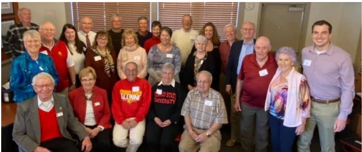
The Tucson, AZ area emeriti gathered at the Golden Corral on February 6 for their annual luncheon