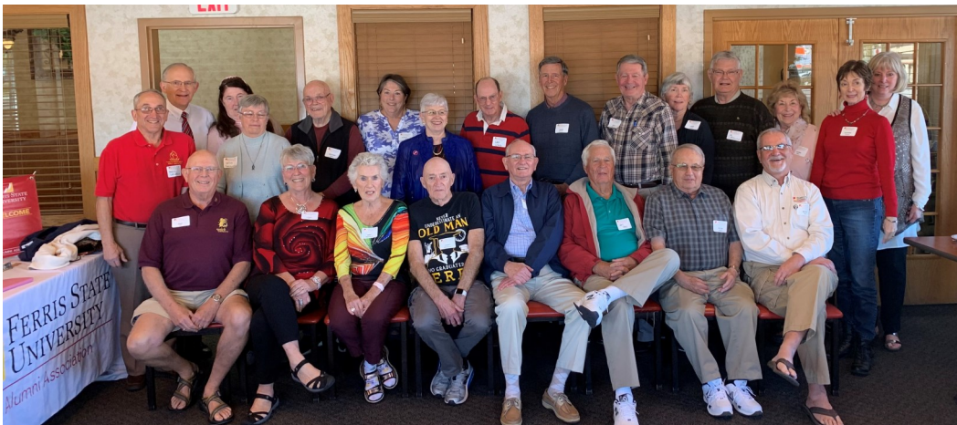
Tucson, AZ emeriti luncheon group met February 7