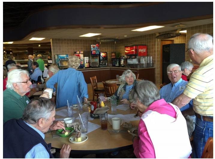
The Spring Luncheon had a record turnout at the Rock Café, May 11th!