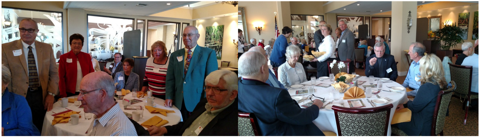
The Annual Alumni, Emeriti and Friends Luncheon took place at TPC Prestancia in Sarasota, Florida on January 23rd.