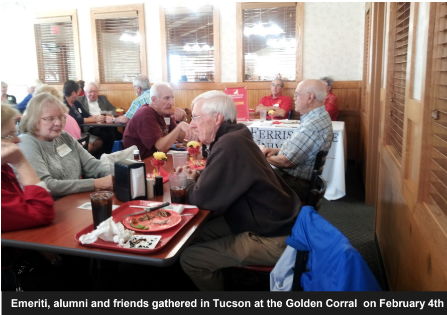
Emeriti, alumni and friends gathered in Tucson at the Golden Corral on February 4th