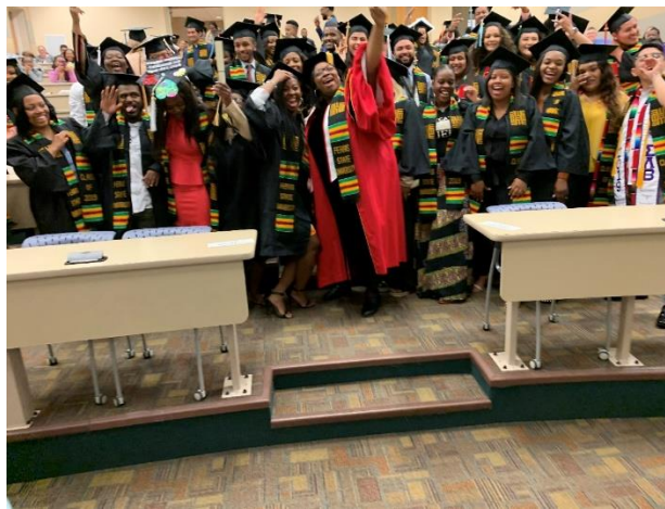
Picture of a Previous Multicultural Graduation Recognition Ceremony

The Multicultural Graduate Recognition Program is an opportunity to recognize our students from diverse backgrounds that have earned an Associates, Bachelors, Masters or Doctorate Degree from Ferris State University. The event was created to celebrate and recognize students who have completed their educational journey, despite and in addition to their marginalized identities, experiences of social exclusion and under-representation. Additionally, the event aims to encourage graduates to continue to strive for excellence after graduation, as well as to inspire current students to continue to work hard on their educational goals.