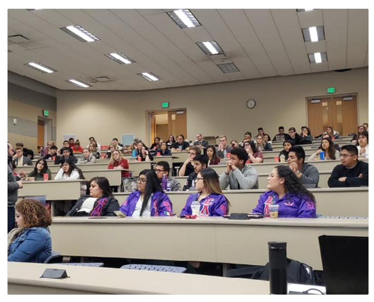
Students, faculty, and staff gather for a Puerto Rico discussion.

The Political Engagement Project (PEP) partnered with the Center for Latin@ Studies, Sigma Lambda Gamma Sorority Inc., Sigma Lambda Beta Fraternity Inc., and Cygnets: Official Interested Group of Gamma Phi Omega to host a panel discussion on Puerto Rico. The event explored the impacts of the natural disasters that affected Puerto Rico since 2017 Hurricane Maria, the renouncement of their governor, and the recent earthquakes.