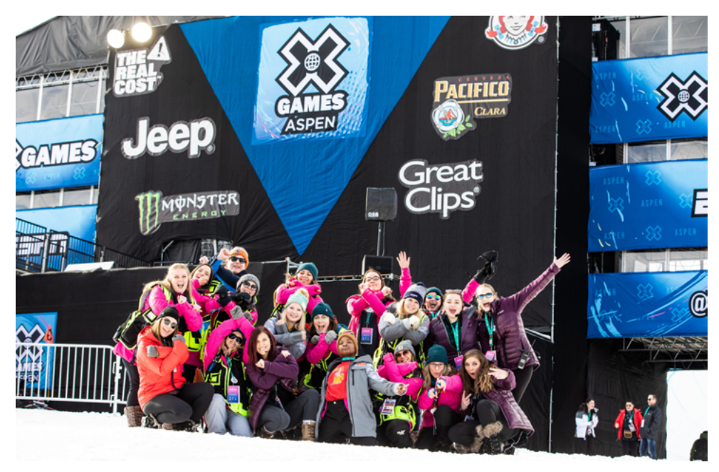
A group photo of most of the Ferris students and alumni who worked the 2020\,\mathrm{X} Games.