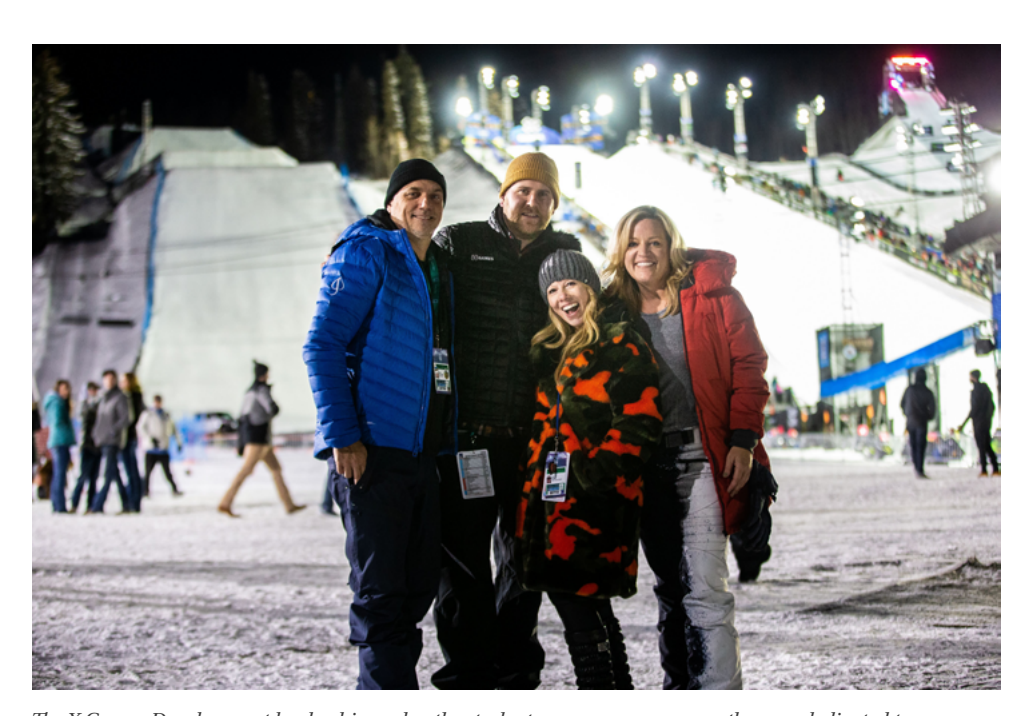
\label{thm:continuous} The X \textit{Games Development leadership makes the student program a success as they are dedicated to educating the students.}

For more information on the Office of Academic Affairs, go to <a href="https://ferris.edu/HTMLS/administration/academicaffairs/index.htm">https://ferris.edu/HTMLS/administration/academicaffairs/index.htm</a> or call (231)591-2300