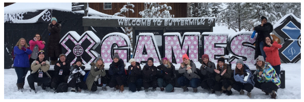
In January, 19 Ferris students representing the College of Business worked at the 2020 X Games in Aspen.

Ferris State University participated again this year with the ESPN X Games Student Worker Program for partnered universities and took 19 students to represent the College of Business at the 2020 X Games Aspen. This year, there was a record number of students working in the most extensive array of departments to date with 11 represented schools from six states, and a total participation of over 50 students. Over 100,000 people attended over the four days of the event held Thursday, January 23 – Sunday, January 26.