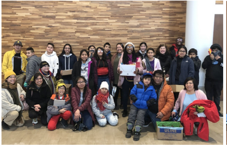
Latino middle school students visited Ferris and explored campus.