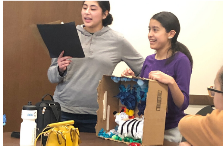
The students created animals at the Card Wildlife Center.