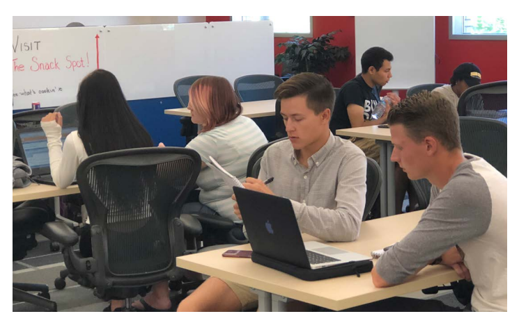
Students enjoying ability to collaborate and learn in new Academic Literacies Center.

The new Academic Literacies Center (ALC) opened its doors for the first time in August. The ALC embraces a holistic approach to student learning, including recognition of the visible and not-so-visible barriers to success. It provides students opportunities to be successful in particular courses, specific content areas, and/or finding ways past their barriers.