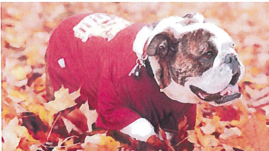
Bulldogs Taking Action—Looking Out for Our Friends and Fellow Students