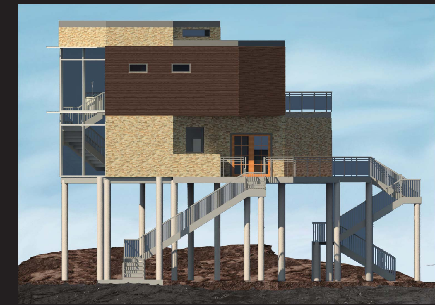
ELEVATION EAST ELEVATION