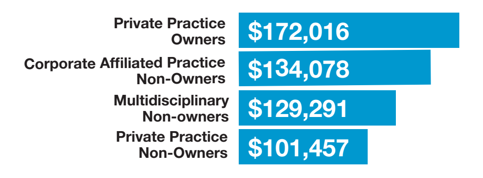
Figure 1: Optometrists' Average Income from Primary Practice by Practice Type & Ownership Status, 2017

$143,520 2017 Optometrist's Average Net Income