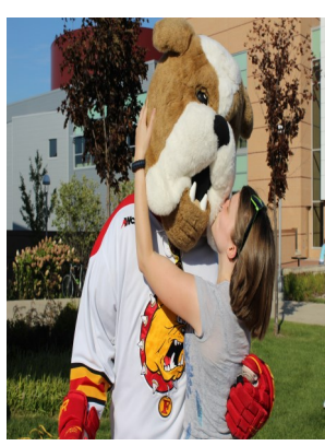
Brutus gets a kiss from a fan.. Everybody loves Brutus!