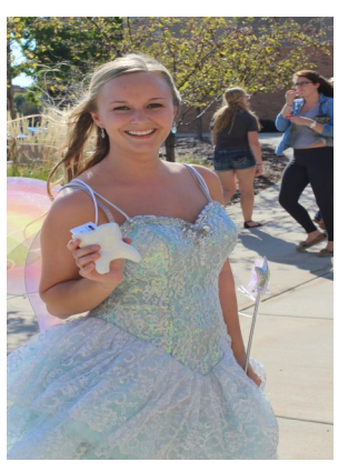
Even a visit from the lovely Tooth Fairy!