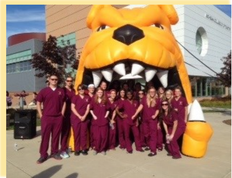
Respiratory Care Class of 2015. See related article on a new BSRT program.