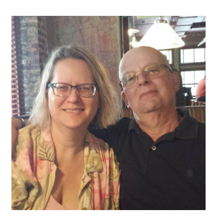
Along the Highway

As we drive down the highway this summer on the way to destinations across the state or country, we encounter a system fully developed to meet our traveling needs. Well-marked and safely-designed interstate highways, all with the same kind of signage, guide us on our way. Exits are spaced regularly, and the services available at each one are identified by signs along the highway before we get there. Even small towns will have a cluster of gas stations, motels, restaurants, and a convenience or big box store near the highway. On toll roads there will be rest stop plazas, and on all major roads, there will be a network of rest stops with vending machines and bathrooms that don't require leaving the highway.