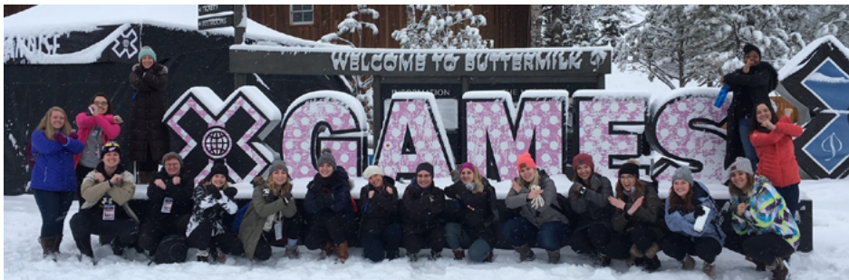
In January, 19 Ferris students representing the College of Business worked at the 2020 X Games in Aspen.

Ferris State University participated again this year with the ESPN X Games Student Worker Program for partnered universities and took 19 students to represent the College of Business at the 2020 X Games Aspen. This year, there was a record number of students working in the most extensive array of departments to date with 11 represented schools from six states, and a total participation of over 50 students. Over 100,000 people attended over the four days of the event held Thursday, January 23 – Sunday, January 26.