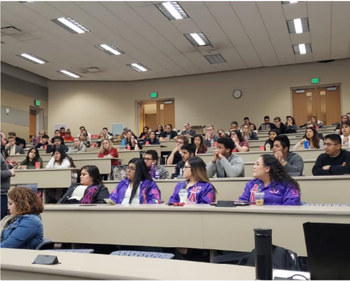
Students, faculty, and staff gather for a Puerto Rico discussion.

The Political Engagement Project (PEP) partnered with the Center for Latin@ Studies, Sigma Lambda Gamma Sorority Inc., Sigma Lambda Beta Fraternity Inc., and Cygnets: Official Interested Group of Gamma Phi Omega to host a panel discussion on Puerto Rico. The event explored the impacts of the natural disasters that affected Puerto Rico since 2017 Hurricane Maria, the renouncement of their governor, and the recent earthquakes.