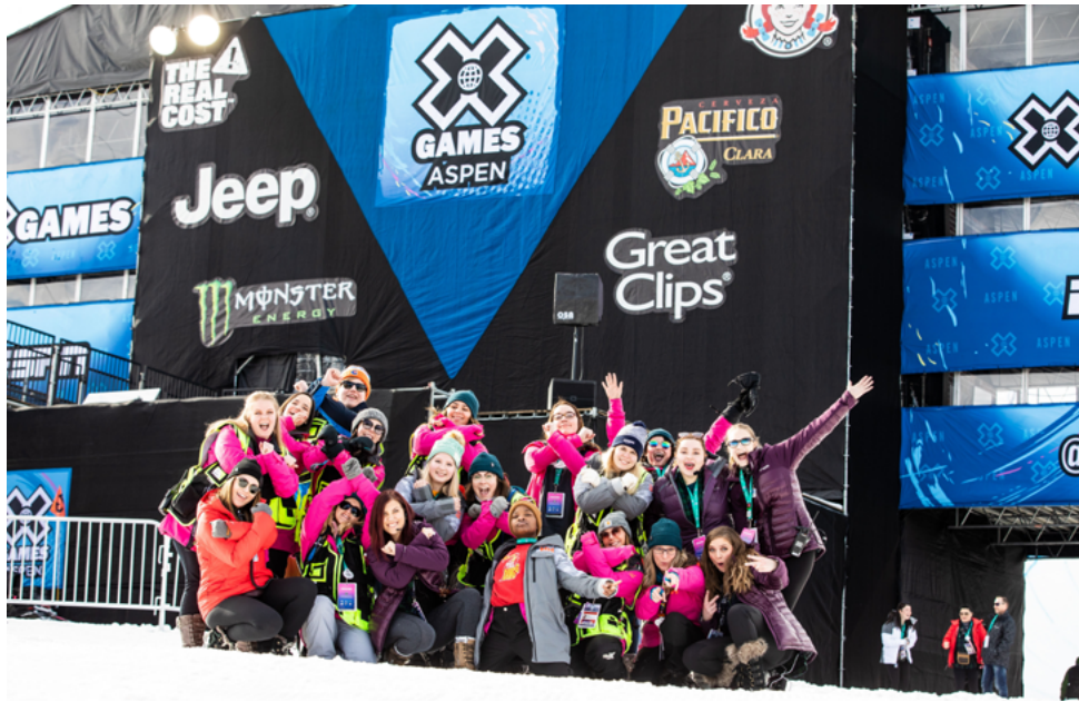
A group photo of most of the Ferris students and alumni who worked the 2020 X Games.