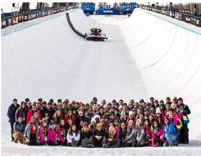
Students from 11 schools participated in the 2020 X Games Student Worker Program in January 2020.