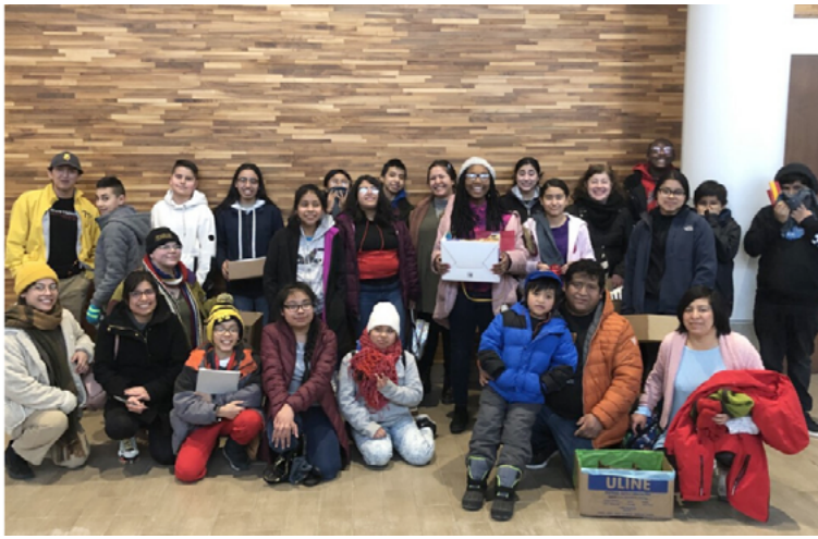
Latino middle school students visited Ferris and explored campus.