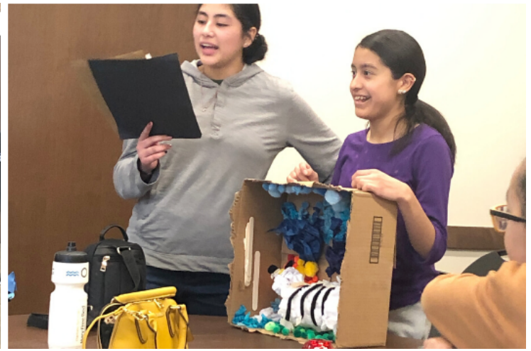
The students created animals at the Card Wildlife Center.

At around noon, the middle school students were taken for lunch to the Rock Café where most took full advantage of the ice cream. A student stated how they would love to come here for the great food. It was a special moment as most of the students had never visited Ferris let alone a college campus.