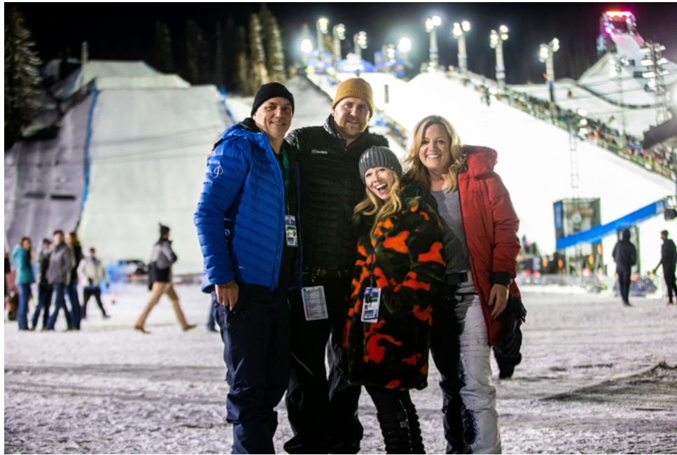
The X Games Development leadership makes the student program a success as they are dedicated to educating the students.

For more information on the Office of Academic Affairs, go to https://ferris.edu/HTMLS/administration/academicaffairs/index.htm or call (231)591-2300