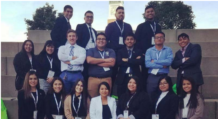
Students are chosen for the new Amigos de Promesa Scholars program.

The CLS provides students with numerous opportunities to fulfill these requirements. On October 18, program participants attended the “Get Focused” summit organized by the WMHCC Building Bridges through Education initiative. The summit was designed to bring awareness to Latinx college students on cultural identity and career development. The event included motivational speakers to discuss self-confidence, social disparity, and networking methods.