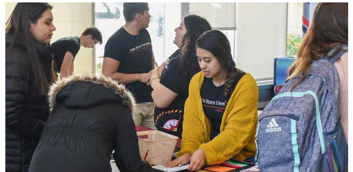
Families attend the Familia Asada event, hosted by CLS.

The Center for Latin@ Studies (CLS) hosted its 2nd annual Bulldog Familia Asada on October 26, and welcomed over 200 FSU faculty and staff, high school students, college students, parents, grandparents, and community partners. Attendees enjoyed the various games, a delectable Latin inspired meal prepared by Ferris Catering, and numerous raffle prizes to spark the Ferris pride in students and families. Princess Elena de Avalor and Brutus also made an appearance at the Asada to welcome family and friends for the weekend. Informational tables were there to provide various resources to students and their families about internships and community resources to support their educational journey.