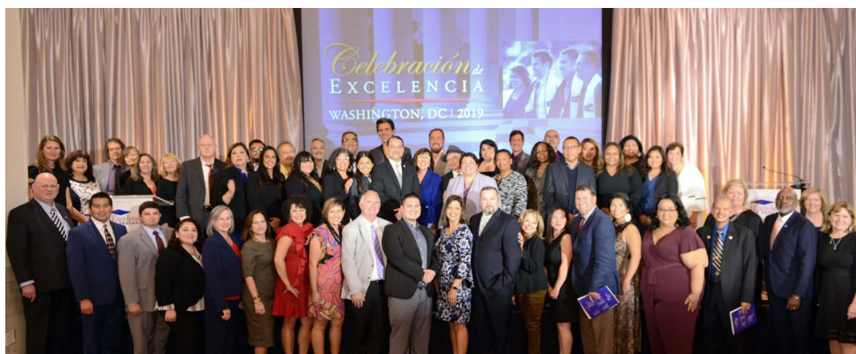
Finalists of the Excelencia in Education, Examples of Excelencia at the 2019 celebration.