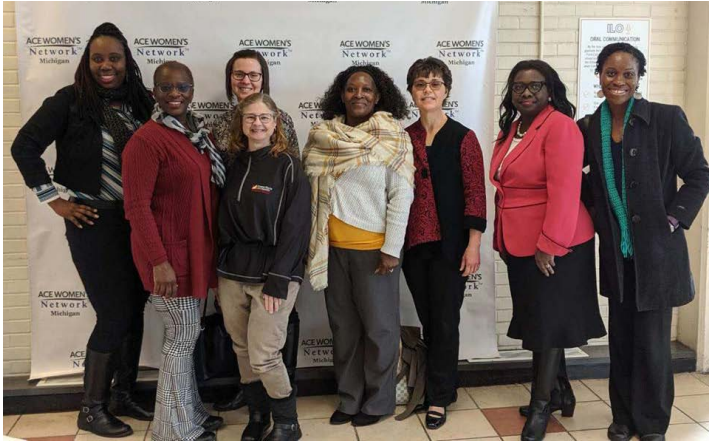
A group of Ferris Women's Network members at the WOCC luncheon.

Ferris Women's Network members attended the Women of Color Collaborative (WOCC) luncheon hosted at Henry Ford College on November 1. This year's theme was "Still Blazing Trails, Still Answering the Call."