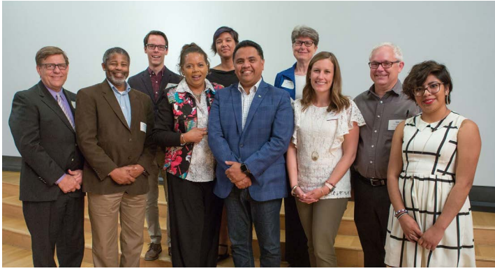
Partners receiving award from Leadership Grand Rapids

In 2013, Habitat for Humanity of Kent County acquired over five acres of land along Grandville Avenue in Grand Rapids with the vision that it could be a catalyst for neighborhood-driven revitalization. Between 2013 and 2015, Habitat Kent initiated a series of neighborhood design charrettes (resident focus groups) and door-to-door surveys within the neighborhood in order to incorporate neighborhood input into the vision for the development. Since then, seven organizations have partnered with the neighborhood to develop Plaza Roosevelt: Habitat for Humanity of Kent County, Grand Rapids Public Schools, Mercy Health Saint Mary's, Dwelling Place, Grandville Avenue Arts & Humanities, Hispanic Center of Western Michigan, and Ferris State University.