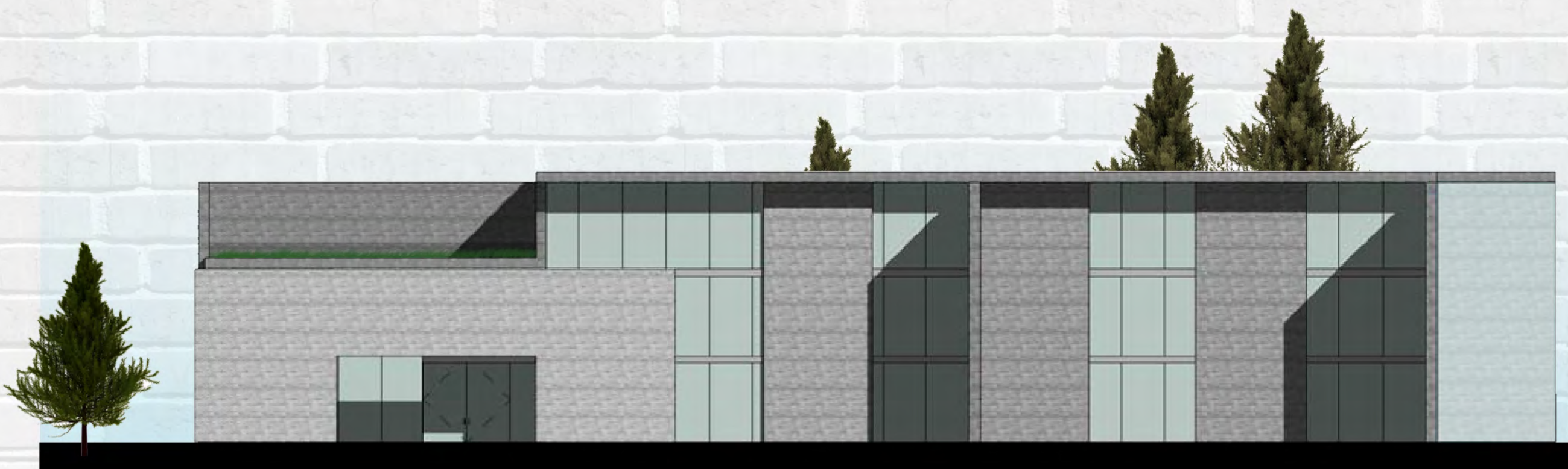
South Elevation 1/16"=1'-0"