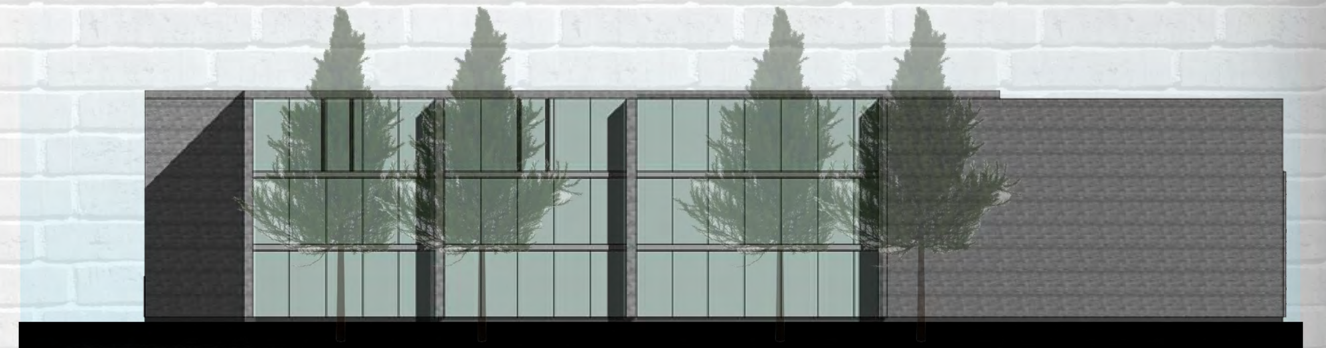
North Elevation 1/16"=1'-0"