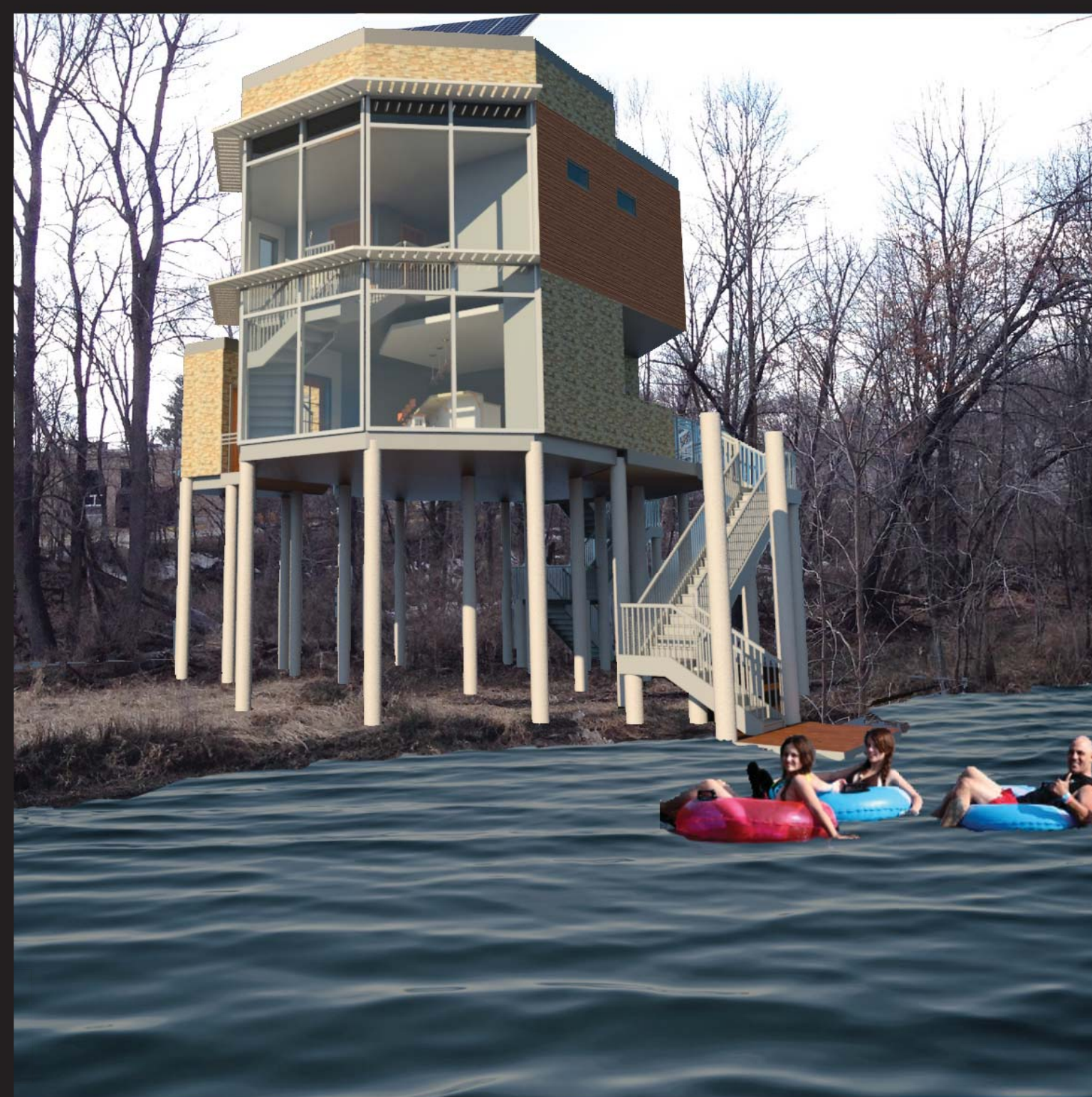
VIEW FROM A TUBE