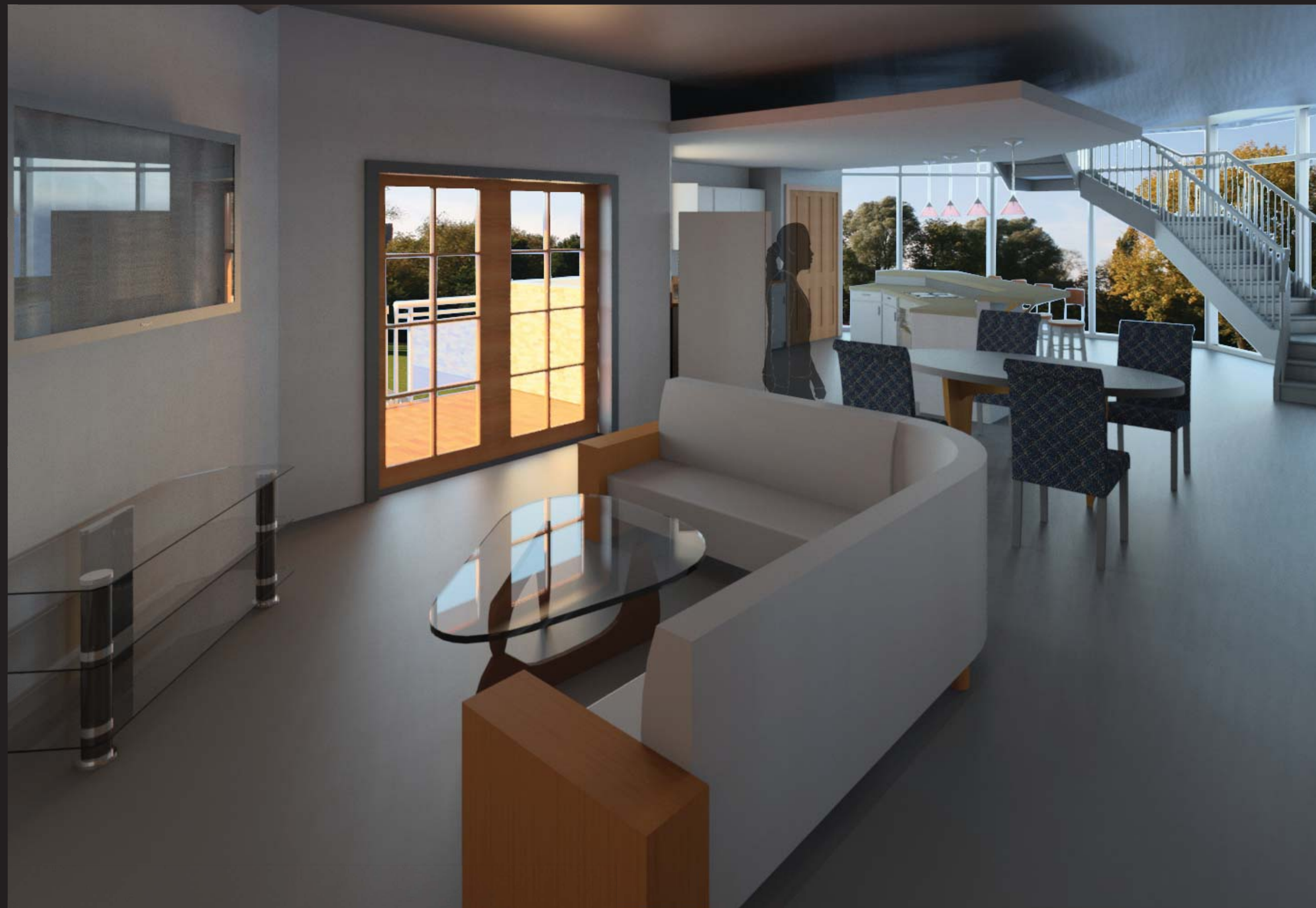
FIRST FLOOR RENDERING