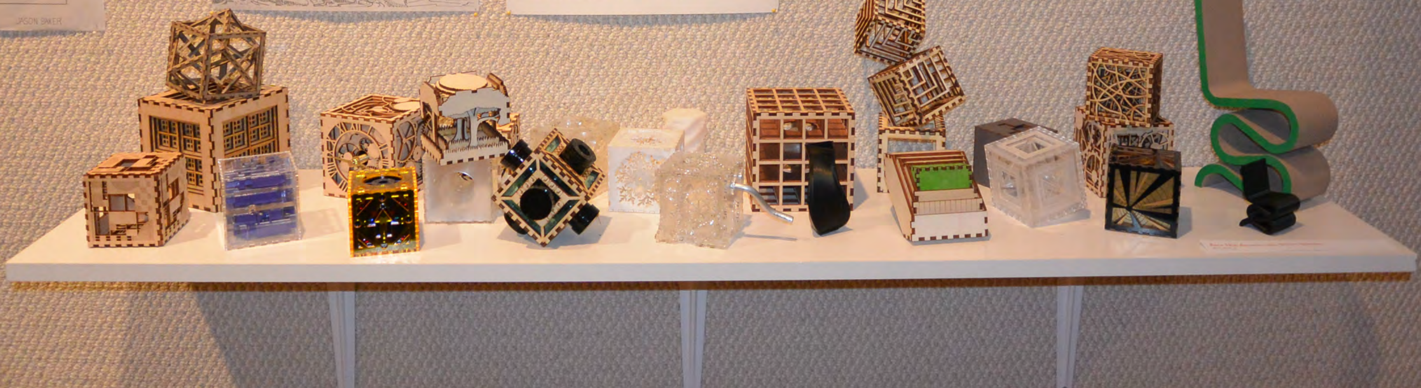
Arch 102: Architectural Digital Graphics