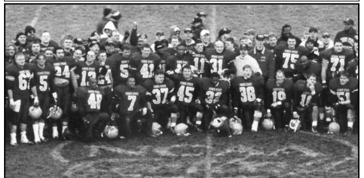
Ferris State made its fifth consecutive NCAA Division II Playoff appearance in 1996 as the Bulldogs advanced to the quarterfinal round before dropping a 23-21 home decision to Clarion (Pa.). The '96 Bulldog squad is pictured above after posting a 24-23 home victory over Indiana (Pa.) in the playoff's first-round action. Ferris finished the campaign at 10-2-0 overall as the Bulldogs claimed their fifth straight Midwest Intercollegiate Football Conference (MIFC) Championship title with a first-place 9-1-0 conference mark.

Home games in bold HC – Homecoming HF – Hall of Fame † – Overtime † – Double Overtime ♦ – Night Game *Great Lakes Intercollegiate Athletic Conference