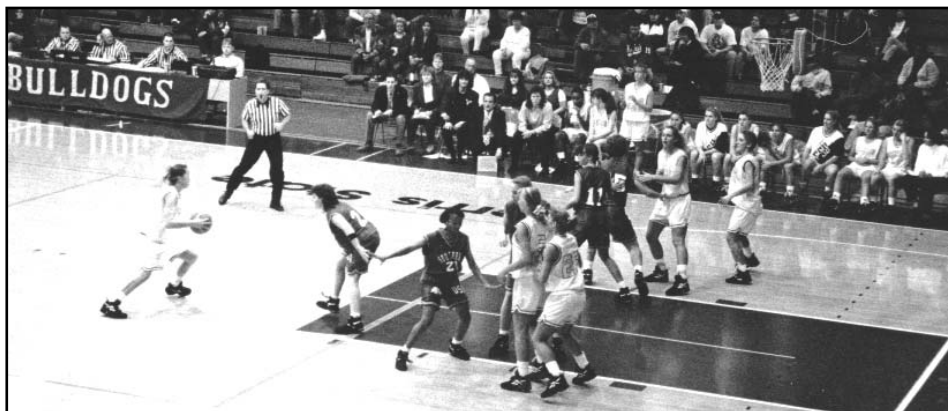
Ferris State played its home games at Old Jim Wink Arena from 1974-98.