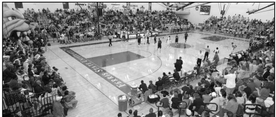
Ferris State has played its home games at the new Jim Wink Arena since the 1999-00 season.