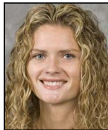
AC Crystal Harris