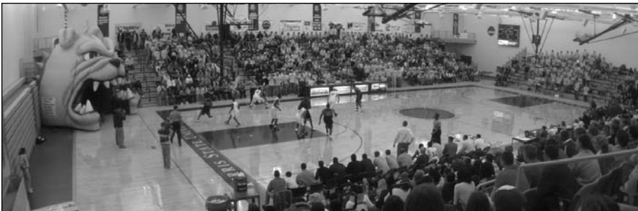
The Ferris State men's basketball program played its home games at Old Jim Wink Arena (top photo) in the Health and Physical Education Building from 1963-98. The Bulldogs compiled an impressive 304-89 (.707) record on the court and won 10 or more home games in a season 15 times. The new Jim Wink Arena is shown in the bottom photo.