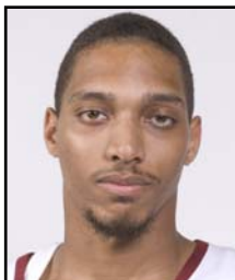
34 Jason Holder