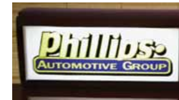
Media/scoring table signage