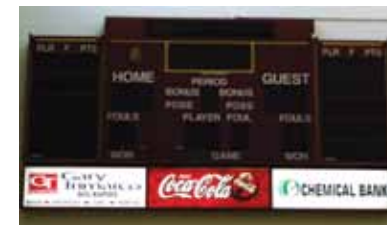
Illuminated scoreboard panels