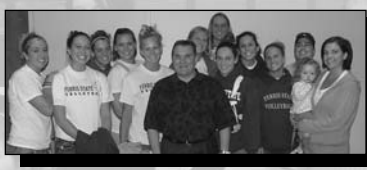
(Above) - FSU squad members pose for a photo with former Notre Dame football player "Rudy".