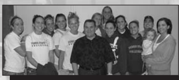
(Above) - FSU squad members pose for a photo with former Notre Dame football player "Rudy".