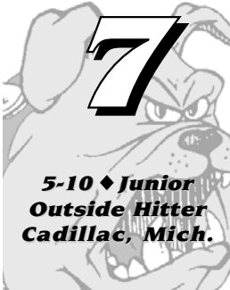
5-10 ♦ Junior Outside Hitter Cadillac, Mich.