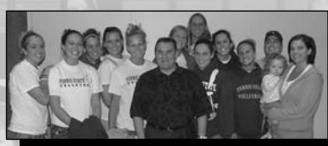
(Above) - FSU squad members pose for a photo with former Notre Dame football player "Rudy".