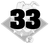
TIM GILL Punter 5-9 ♦ 159 ♦ Senior Mt. Clemens (Lutheran North)

Returns for third year as team's top punter . . . Shows good leg strength . . . Left-footed kicker . . . Came to FSU as a walk-on . . . Averaged 34.6 yards on 60 attempts for 2,076 yards last season . . . Had a 38.2 average (306 yds.) on eight punts vs. Saginaw Valley State (10/26) with a season-high 54-yarder . . . Notched a 32.7 average (1,471 yds.) on 45 attempts in 2001 . . . Averaged 39.1 yards (7-274 yds.) at Hillsdale (11/3) and 37.2 yards (8-298 yds.) at Northern Michigan (10/27), which included a career-best 60-yarder . . . Recorded a career-best 35.4 average (601 yds. on 17 kicks) as a frosh in 2000 . . . Tallied a season-best 41.8 average at Findlay (9/9) with 167 yards on four attempts . . . Booted a 57-yarder vs. Saginaw Valley State (9/16) . . . Earned all-county accolades at Lutheran North High . . . Coached by Paul Keiper . . . FSU Letters: Three . . . Birthdate: 10/14/81 . . . Major: Small Business and Entrepreneurship.