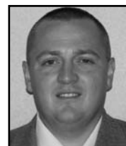
ROB BENTLEY Athletics Communications