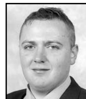
ROB BENTLEY Athletics Communications