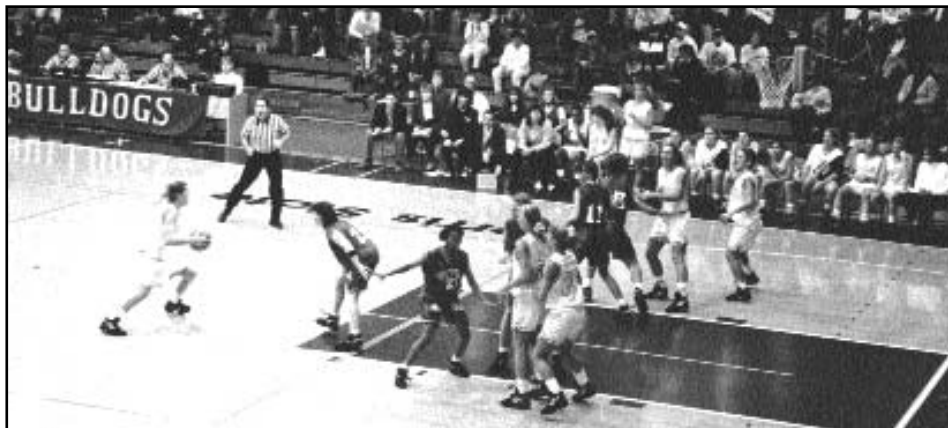
Ferris State played its home games at Old Jim Wink Arena from 1974-98.