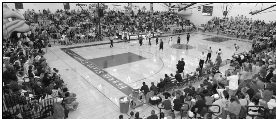
Ferris State has played its home games at the new Jim Wink Arena since the 1999-00 season.