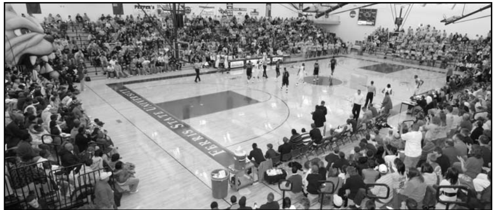
Ferris State has played its home games at the new Jim Wink Arena since the 1999-00 season.